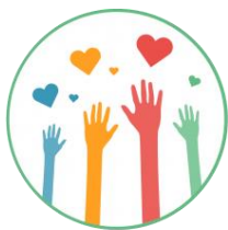
Nailsea Community Group

For All Healthy Living Company , runs the Healthy Living Centre and provides a range of services, facilities and activities for the local community of South Ward in Weston-super-Mare.